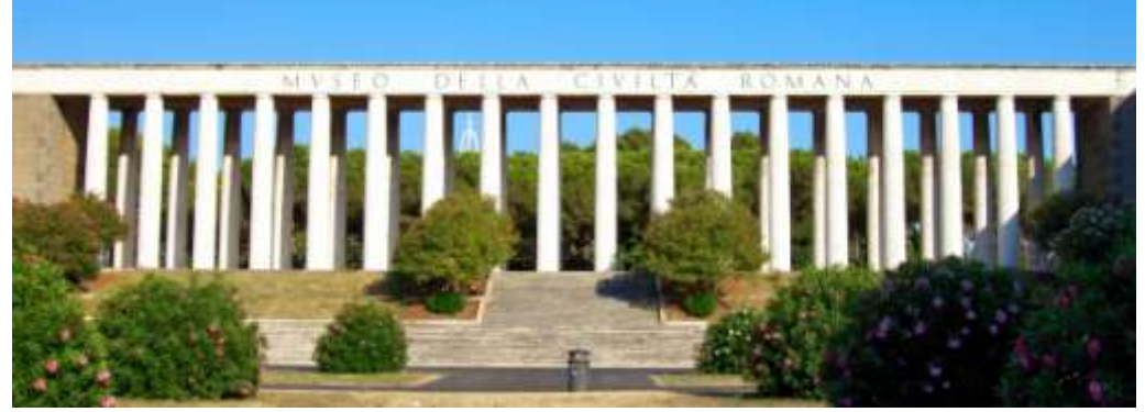
Museo della Civiltà Romana (Museum of Roman Civilization)