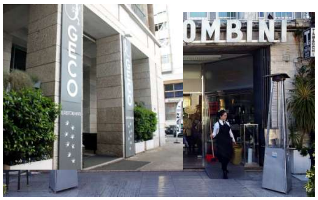
Geco is a restaurant in the area of the Obelisk. It's pretty chic and its neon light make its atmosphere evocative. Here you can eat Italian delis, pizza, and also Roman specialities. Young people come here before going to disco.

Otbred is a restaurant and a cafè furnished with ecofriendly materials. Here you can relax and eat organic home made sandwiches and try different coffees.