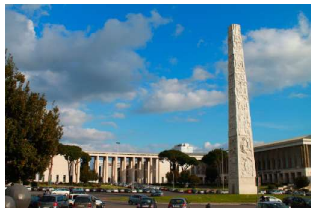
The Obelisk is 45 m. high and it was inaugurated in 1959 in view of the Olympic Games. It is dedicated to the great Italian inventor Marconi. The area around it is full of discos.