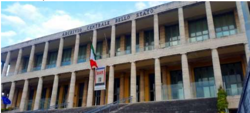
Archivio Centrale (Central National Archive)

Other examples of the mixture of Italian rationalist and traditional classicist style are: